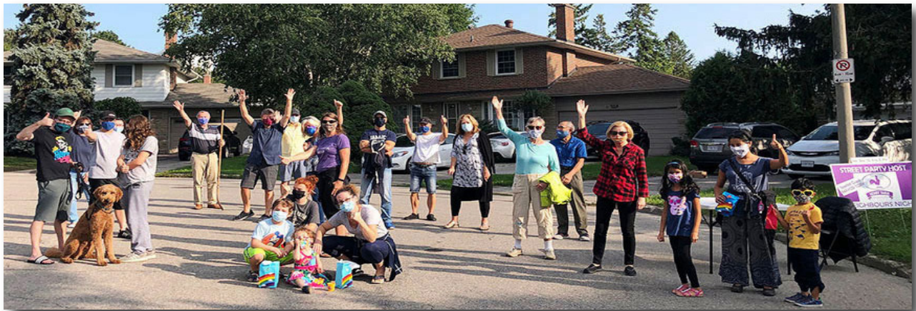
One of the many fun street parties at last year's very successful Henry Farm Neighbours' Night Out!

Stay tuned for announcements on activities and plans closer to the date!